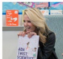
Jennifer Siebel Newsom First Partner of California